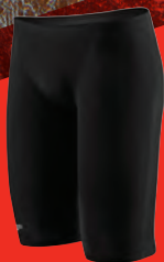
SPEEDO® + LZR RACER® ELITE JAMMER