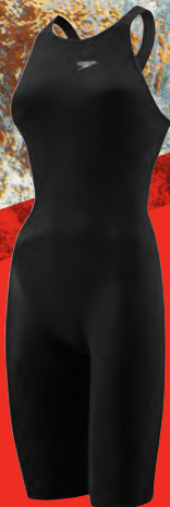
SPEEDO® + LZR RACER® ELITE RECORDBREAKER KNEESKIN